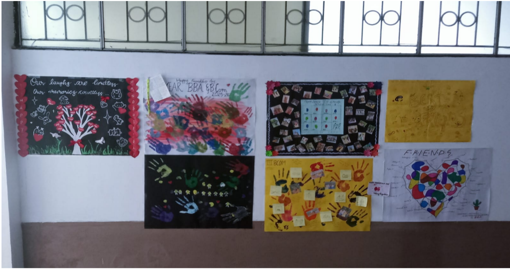
Colours of Friendship: Chinarts Friendship day wall

Chala: Chinmaya Arts and Science College for Women recently celebrated Friendship Day with a special program, bringing students together to bond and create lasting memories.