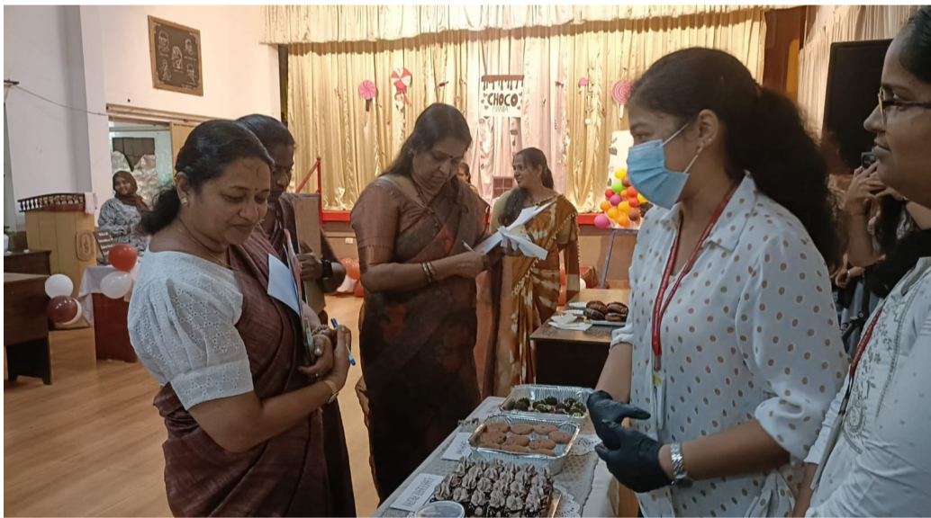
Sweet Surrender: Judges evaluate the handmade chocolate treats crafted by students

Chala: Chinarts hosted a vibrant Chocolate Day program, bringing together students and faculty for a sweet celebration.