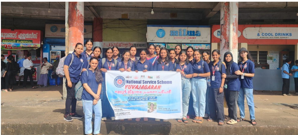
Empowering the community: Chinartz NSS students

Kannur: Chinarts NSS students, in collaboration with the Yuvajagan program, organized a dynamic AIDS awareness event at Kannur on July-29.