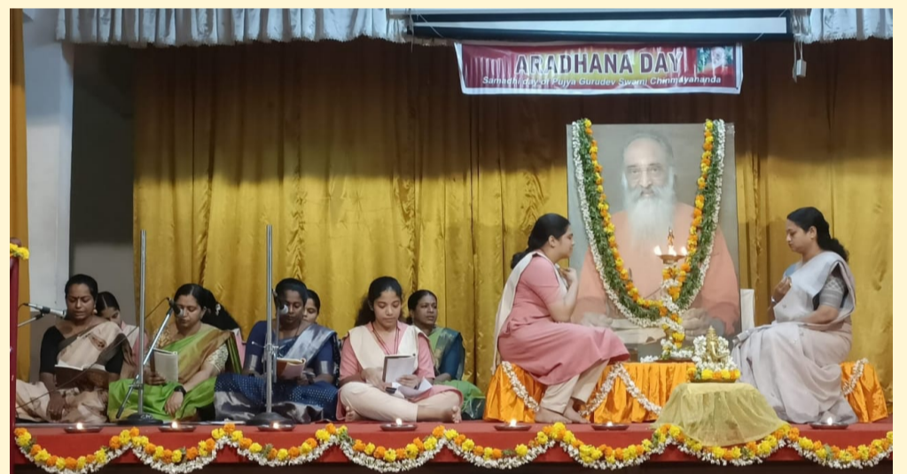
Tribute to a spiritual giant: Swami Chinmayananda's Aradhana Day observed with devotion and reverence.

Chala: The students and faculty members of Chinmaya Arts and Science College for Women came together to observe Swami Chinmayananda's Aradhana Day with great devotion and enthusiasm.