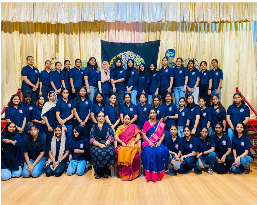
Wearing Unity, Serving Humanity: NSS volunteers of Chinmaya Arts and Science College for Women donning their new uniforms.

Parents need to be educated on the changing dynamics of student life to provide the right balance of guidance and emotional support. We must recognize the critical importance of mental health in students' lives and take concrete steps to foster a supportive environment.