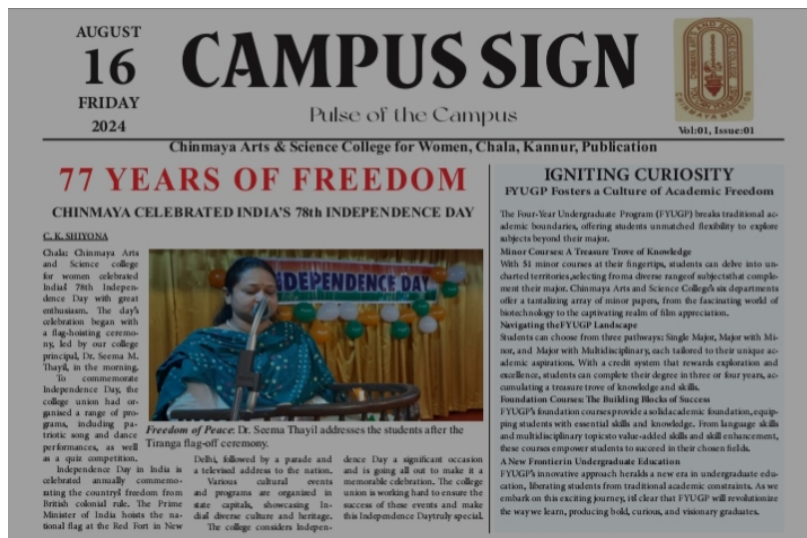
Old Face: Campus Sign in its first Issue

The campus newspaper CAMPUS SIGN serves as a vibrant Platform for students to express their voices and showcase their talents